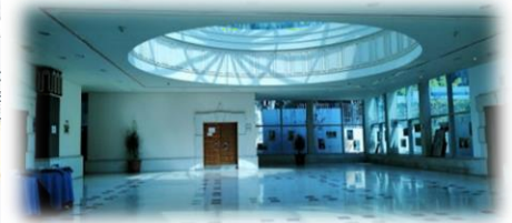
Main Gate of UJ